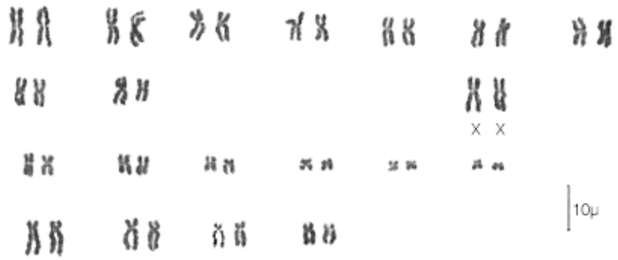
Figure 2. Conventional karyotype of Fuegian beaver, 2n=40 .

Beavers colonized all streams and occurred in nearly all aquatic habitats. Low gradient ( 0-6^\circ ), first and second order streams were selected by beavers. Higher-order streams were seasonally occupied (Coronato et al. , 2003). The rivers of the lateral hanging valleys were more densely occupied than those of the slope units. Clear-cutting by beavers in riparian forests dominated by deciduous ( Notophagus pumilio ) or evergreen ( N. betuloides ) species promoted the formation of grasslands with high productivity, probably due to in-