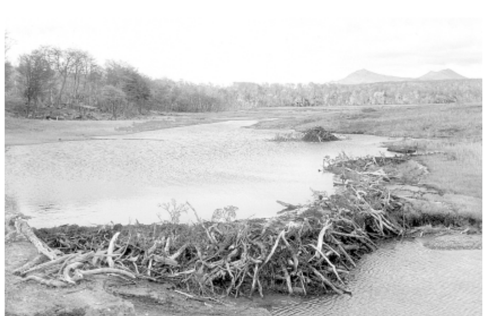
Figure 3. Flat valley and adjacent wet area

Austral beavers forage on trees of the genus Nothofagus ( N. betuloides , N. pumilio and N. antarctica )